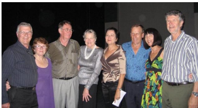
Glammed-up Novice Team Winners and partners at the dinner dance