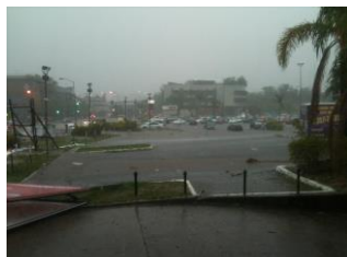
During the Storm