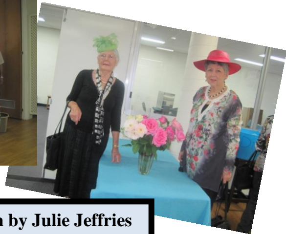
Melbourne Cup