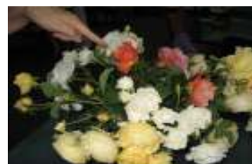
We took time to smell the roses on the Cup tables.