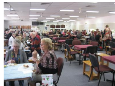
Queensland Mixed Pairs Championship and Toowong Novice Pairs Events