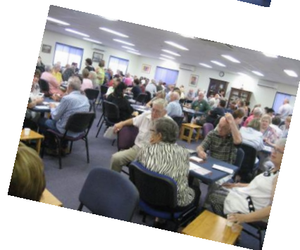
A crowded house at Arana