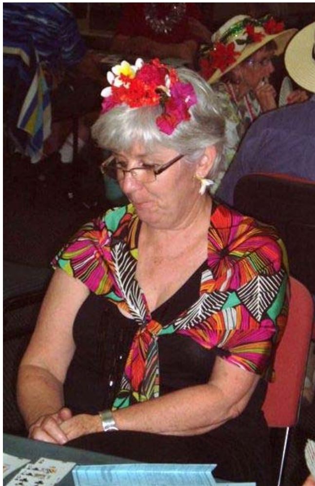
In lieu of a message from Monica.