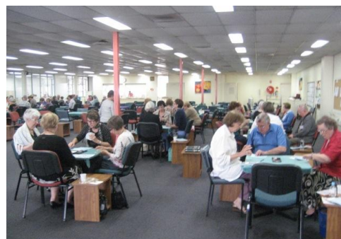
Every 4 th Tuesday you can participate in a just-for-fun teams event at QCBC.