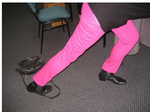
Secure your handbag. Recently, a wayward strap caused a nasty fall. OUCH!

We could have taken this six down but I inadvertently crashed one of partner's heart tricks, not expecting one there. The 1100 penalty only lost us 7 IMPS compared to 6C at the other table. We seemed to have been out-manoeuvred on both these boards and at score-up we were astonished to have edged a win in the match. We stopped in 3NT on one hand where the other table tried for slam, and then a couple of scattered IMPs got us over the line.