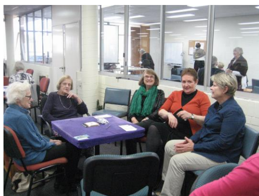
The Friday Coffee Club